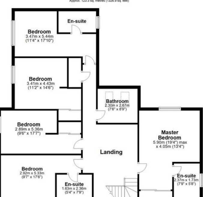
First Floor Approx. 123.3 sq. metres (1326.9 sq. feet)

Total area: approx. 277.7 sq. metres (2989.4 sq. feet)