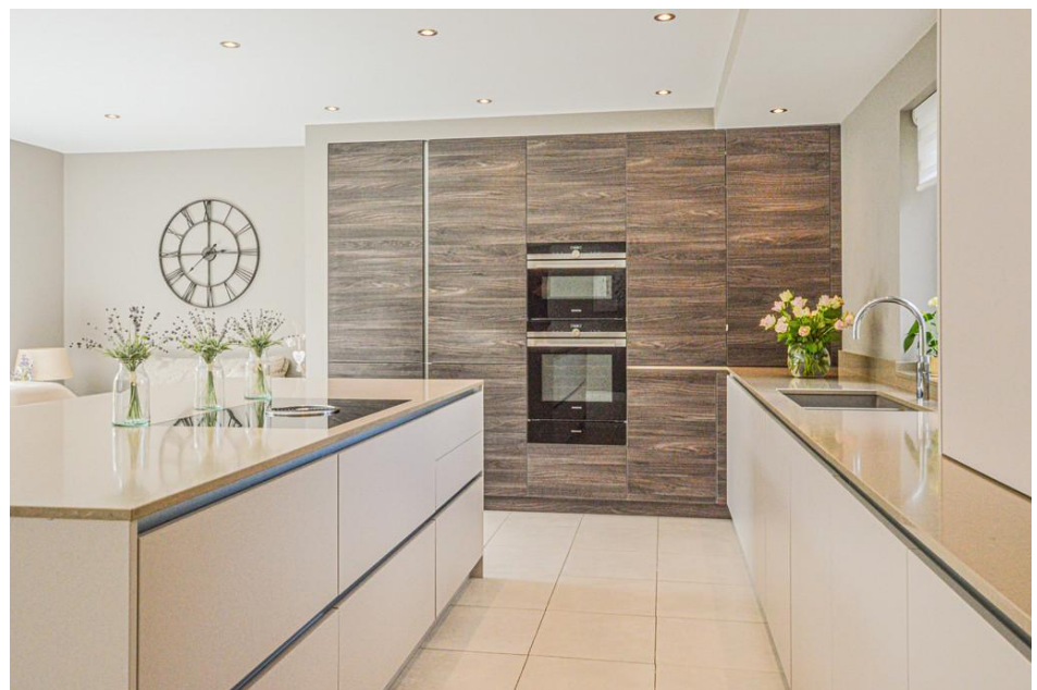
Abbey Gardens Shepley, Huddersfield